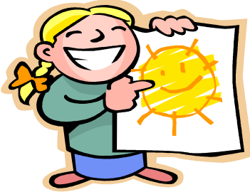
Miss Snapp (Available only to 3 rd Graders)

This after school club will be super popular for students in Grade 3 who love to draw, paint, and create their own pictures.